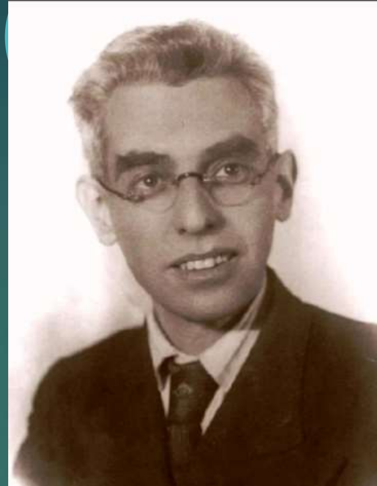
A.R.Luria the young scientist