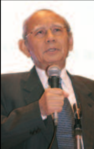
EMIL SALIM, Professor, University of Indonesia Member, Asia-Pacific Forum on Environment and Development

Sustainable development requires a system of life-long learning and education that transforms values.