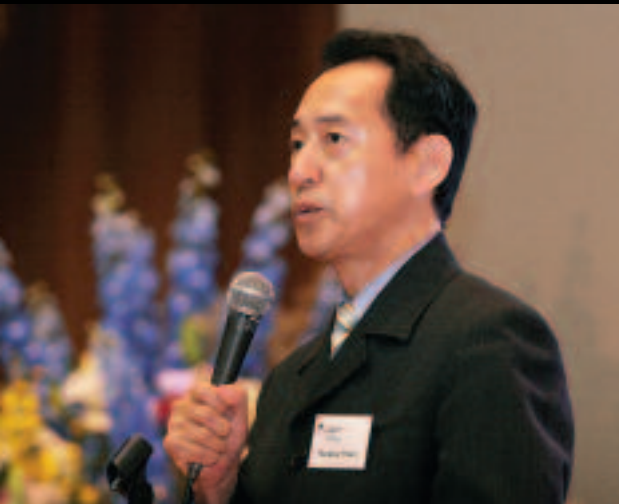
MAMORU MOHRI, Astronaut and Executive Director/CEO, National Museum of Emerging Science and Innovation, Japan