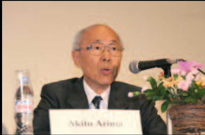
AKITO ARIMA, Former Minister of Education, Japan

Respect for nature is at the heart of traditional Asian cultures.