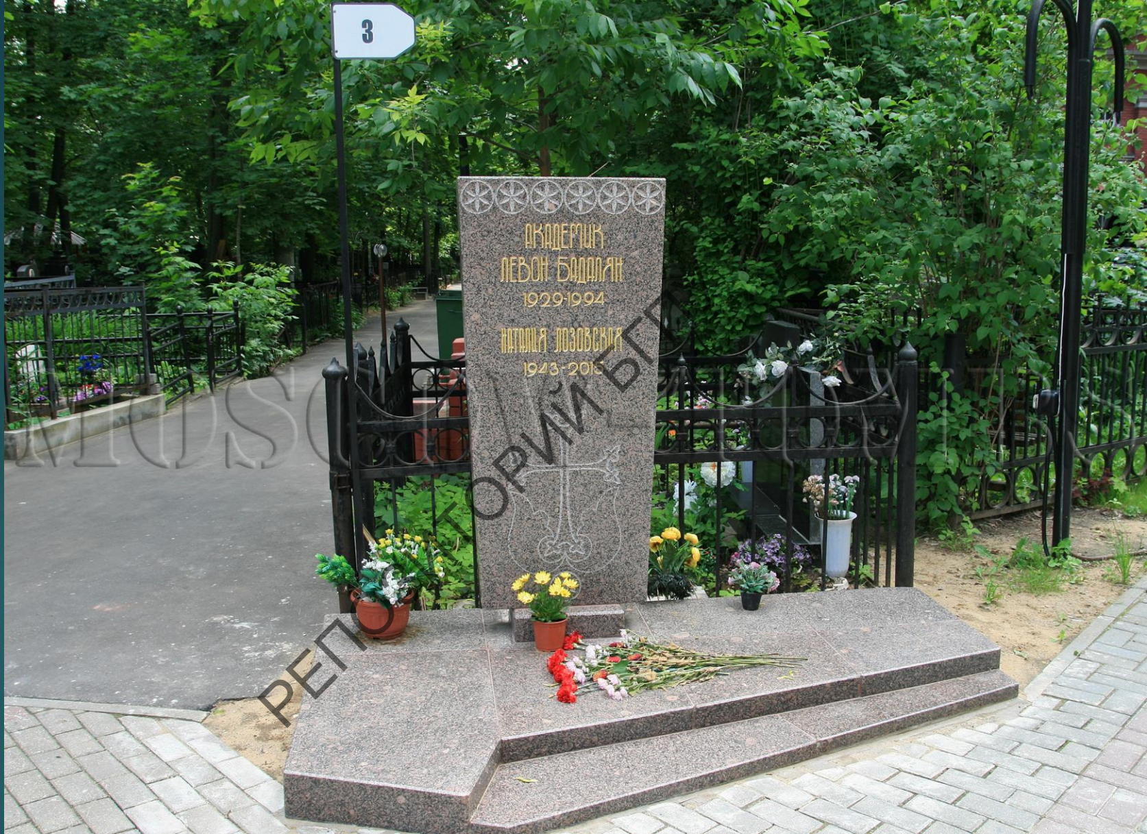
Badalyan's grave at the Armenian Vagankovsky cemetery (Moscow)