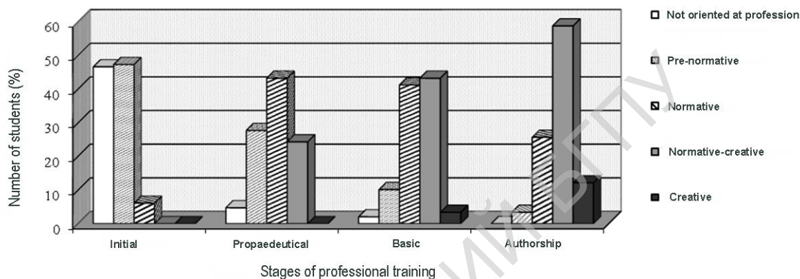
Fig. 2. Levels of students' readiness to self-organization of their activity based on personal self-analysis at 3 stages of pilot project

Analysis of the research results revealed the levels of students' readiness for self-organizing activities based on self-analysis of one's personality and behaviour. The level distribution at three stages of the pilot project is presented in the histogram (Fig. 2).