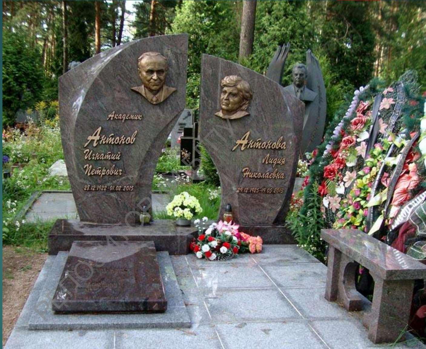
I.P. Antonov's grave at Vostochnoye cemetery (Minsk)