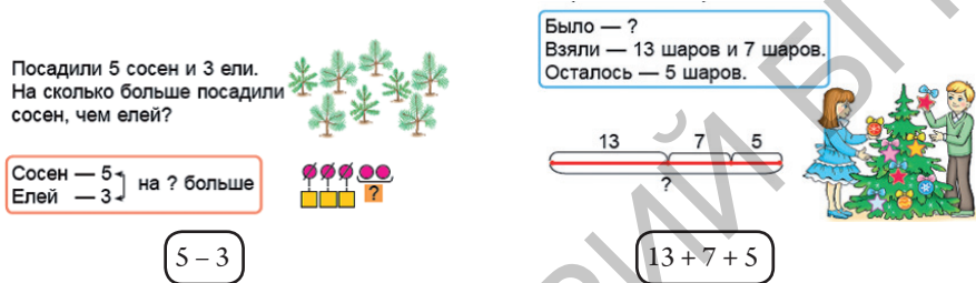
Figure 1. Example of visual, verbal and symbolic models of verbal problems in the Belarusian teaching materials in Mathematics

The set of math's educational materials, based on the ideas of using modeling as an instrument of problem solving, was launched in the Republic of Belarus in 2011. The set of books consists of a textbook, tutor's manual, writing book, test book, writing book for challenging tasks and digital educational resource. Figure 1 shows an example of visual, verbal and symbolic models of verbal problems in Grade 2 Mathematics Textbook [Muravyova & Urban 2016], and figure 2 – examples of models made by children.