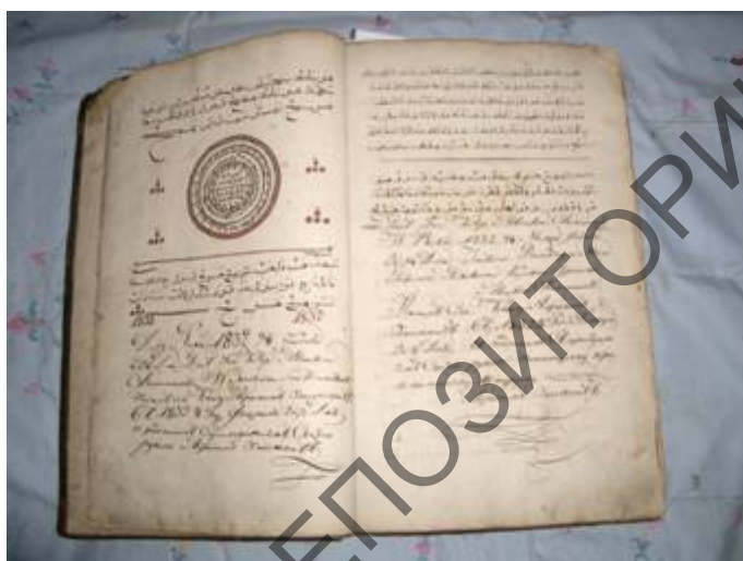
Kitab. 1832. [watermark: Klepicov S.A. The book I, № 68 – 1814, 1829, [1830]; see also the copyist's note – pp. 156-157]; Smilovichi, Minsk region.